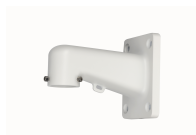
DH-PFB305W Wall mount bracket